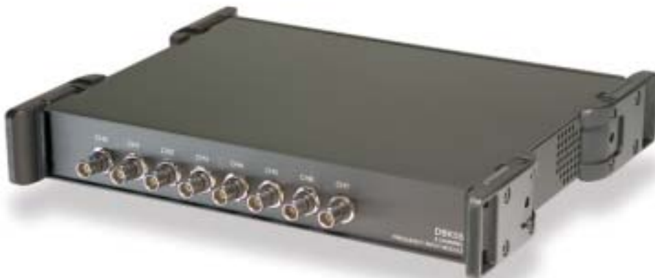
The DBK55 provides eight frequency inputs

The DBK55™ frequency-input card provides IOtech's data acquisition systems with eight channels of frequency-measurement capability. The card measures the input signal's frequency and converts the frequency to a voltage, which can then be measured by the data acquisition system. The DBK55's output is read by the data acquisition system along with any other analog channels included in the analog scan group, allowing easy correlation of readings from the DBK55 with other test parameters. The DBK55 is particularly useful for making RPM measurements in applications such as automotive testing or the monitoring of flow meters. As many as 32 DBK55s can be connected to one data acquisition system for a total of up to 256 channels. The DBK55 accepts low- and high-level analog signals, as well as digital signals.